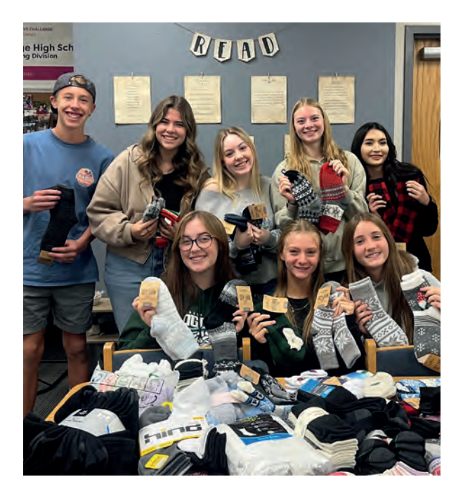
Visit hov.org/volunteer to learn more about volunteer opportunities.

We thank all our dedicated volunteers for helping Hospice of the Valley provide such beautiful care to our patients and families, especially those in need.